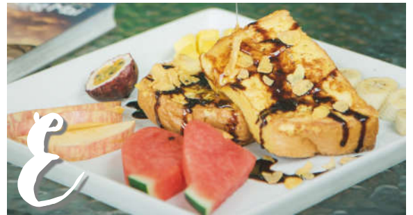
French Toasts 法式吐司