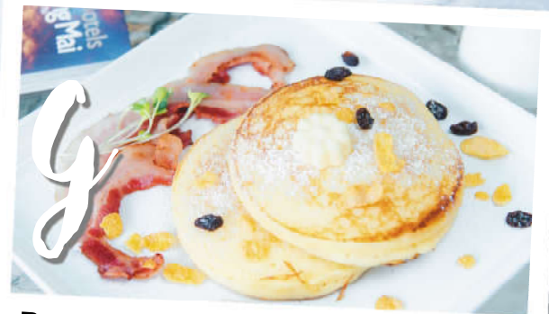
Bacon Pancakes 煎饼和培根