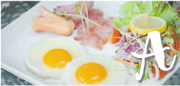
Fried eggs with ham, bacon, sausages 煎鸡蛋配火腿, 培根, 香肠