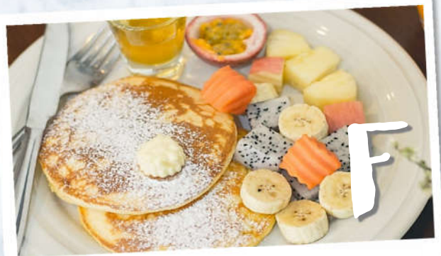
Fruit Pancakes 水果煎饼